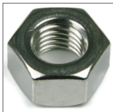
HEAVY HEX NUTS

HWH, Modified Truss, Phi lips, Wafer Head