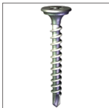
DRYWALL SELF DRILLING SCREWS

HWH, Modified Truss, Phi lips, Wafer Head