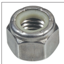
NYLON INSERT LOCK NUTS

Coarse Thread, Fine Thread Grade 2, Grade 8