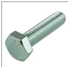
HEX CAP SCREWS

Full Thread, Partial Thread Grade 2, Grade 5, Grade 8, HDG, SS304, SS316