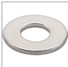
HEAVY FLAT WASHERS